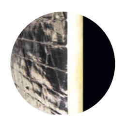
Foil-backed, ½" insulation blanket inside the cabinet reduces sound transmitted into the quest room